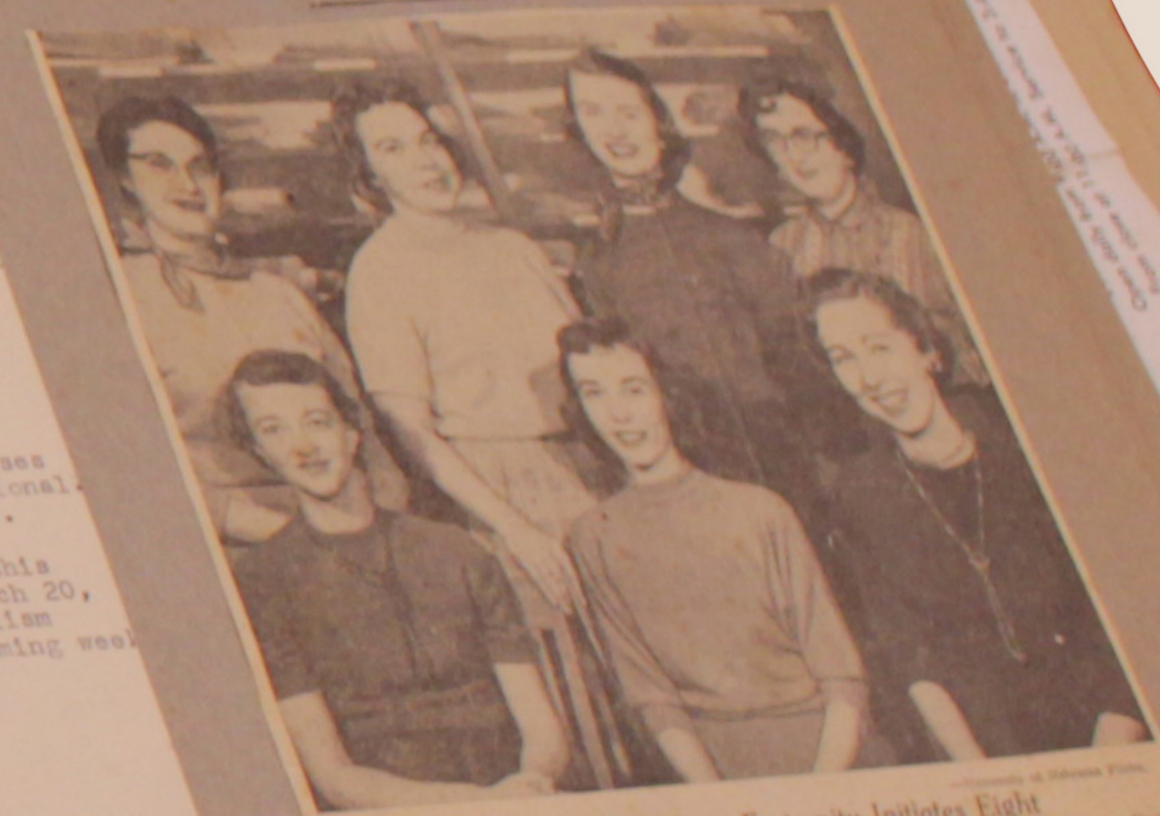
U. of N. Journalism Fraternity Initiates Eight